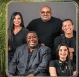
Alfareros Ganadores Grammy